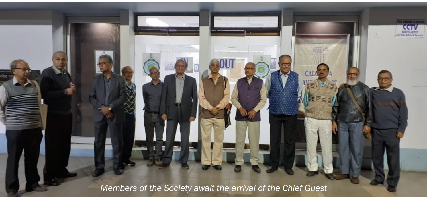
Members of the Society await the arrival of the Chief Guest