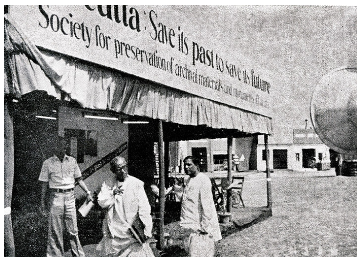
The Society's pavilion - a popular site at the Book Fair